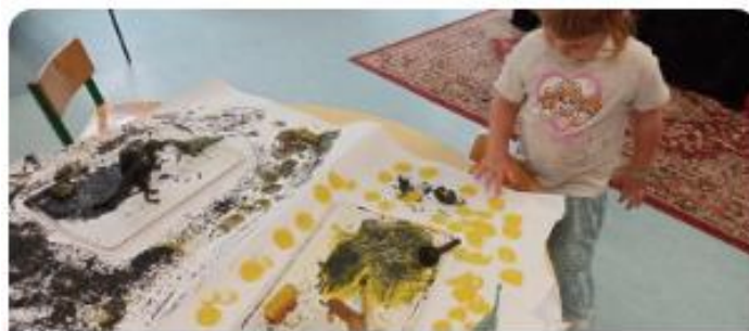
Messy Play Wek at Houghton Valley Playcentre

https://www.eventfinda.co.nz/2023/messy-play-wek-at-houghton-valley-playcentre/wellington